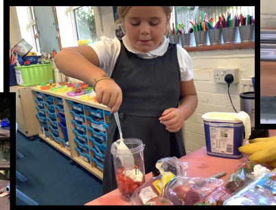
Fox Class smoothies