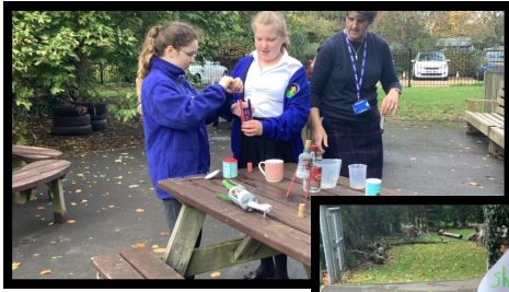
Owl Class rockets

Each class has completed their innovate tasks to end their topic this week. Here are just a few photos from each Class.