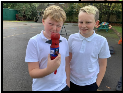
Squirrel Class fruit kebabs