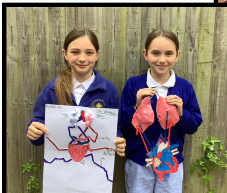
Owl Class have used their Science knowledge to make 3D models of the Circulatory System.