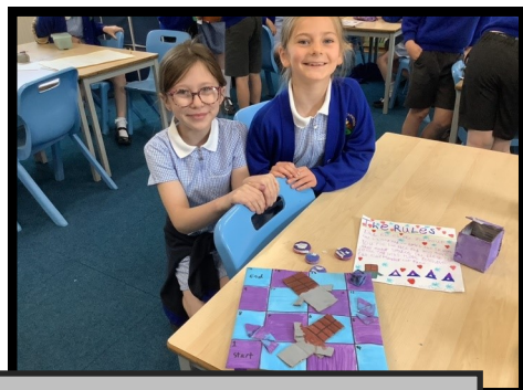
Fox class combined knowledge and skills from Science, DT and English to make magnetic travel games, complete with instructions.