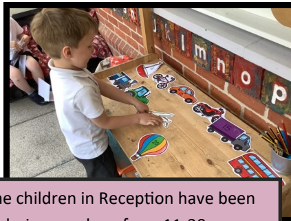
The children in Reception have been ordering numbers from 11-20.